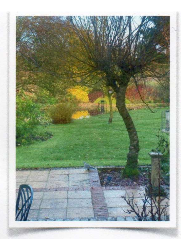
Acer with bird feeders

Another tree which graces the garden in another pine - a Bhutan pine ( Pinus wallachiana Griffithii ). We were given this tree when it was very small which had been planted in a friend's seaside garden but had not been particularly happy in a sea-spray