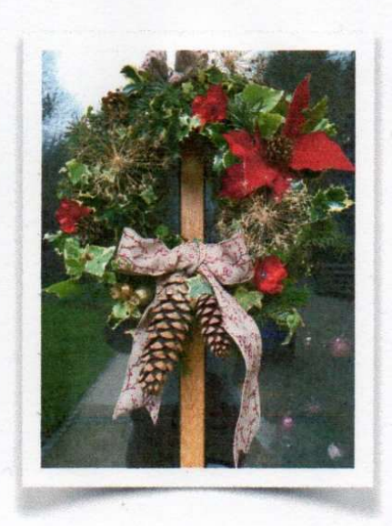
Cones from the pine