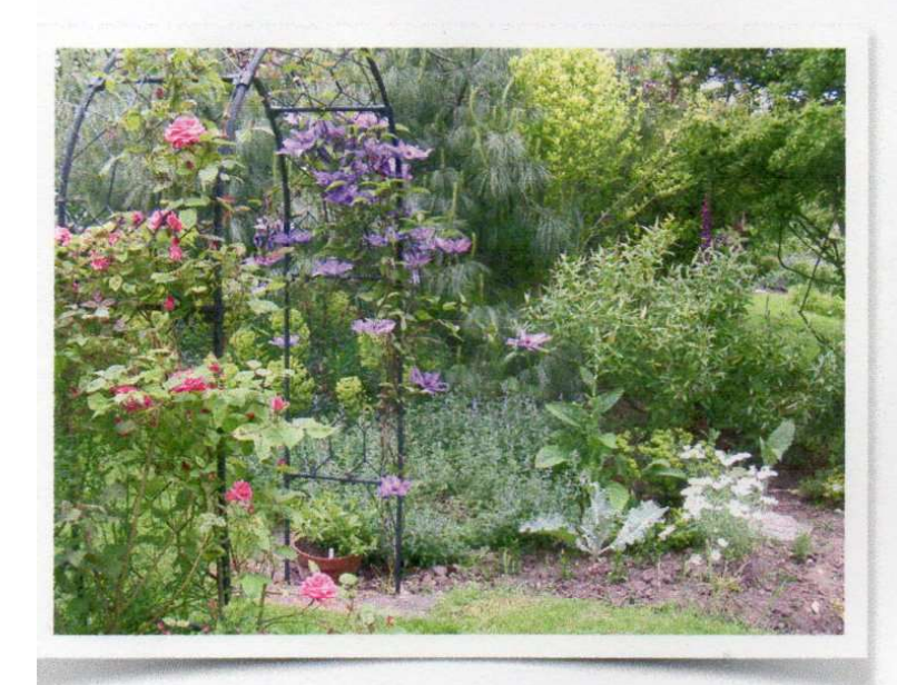
Bhutan Pine in the distance

Those of you old enough to remember 1973 reasonably clearly may just recall the government incentive to plant trees with the catchphrase "Plant a tree in seventy-three". This was because of a virulent strain of Dutch Elm disease which was rampaging through the UK killing millions of elm trees. My school bought in a large number of saplings of Hawthorn, Rowan and for some unfathomable reason Lawson Cypress.