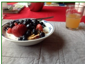
A typical High Trees breakfast

According to Chris Myers, a designer of a show garden at Chatsworth this year, 97% of wild flower meadows in the UK have gone in the last fifty years. Those we have left need to be protected and cherished. Grass with no wild flowers growing in it may be good for bowling greens, cricket pitches and croquet lawns (although I have always enjoyed the challenge of the mole hills on ours) but in lacking bugs, bees and butterflies we also lack birds. More importantly we don't get pollinators, and it is estimated that 84% of crops grown in Europe are insect pollinated.