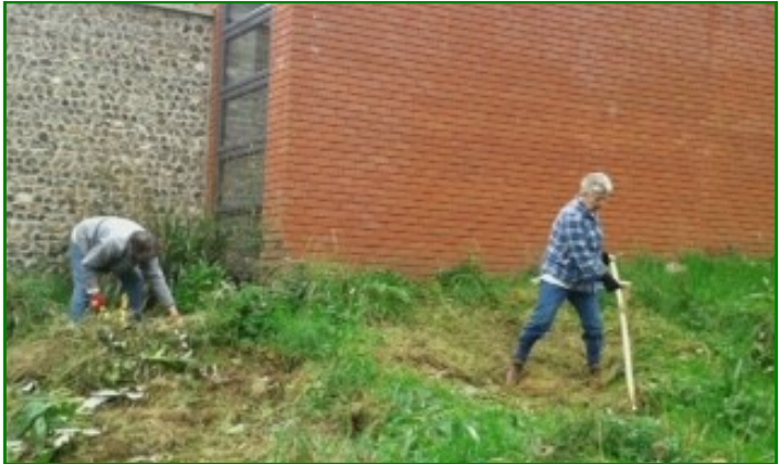
Weed activists - New Park Centre wild flower bank

Post Script: If anyone wants some wildflower plugs or seeds, or more advice, let me know ( janetandgerry@googlemail.com ). I have a friend who might be able to provide some cheaply - any profits to fund other wildflower initiatives in the local area.