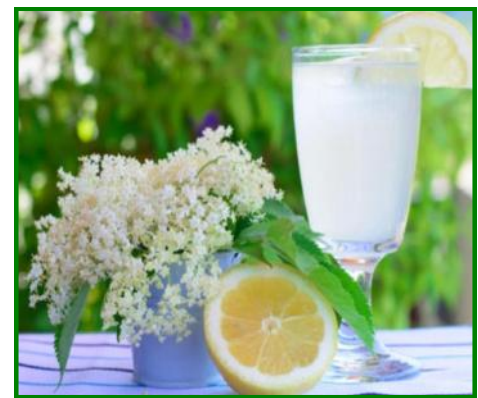
An expensive drink at the local hostelry The High Trees alternative!

of crabapples, rose hips and medlars. Some trendy London restaurants are even putting these on the menu and winning Michelin stars in the process. Well - the diners at these places are not getting their exercise at the green gym and really should know that the best things in life are free!