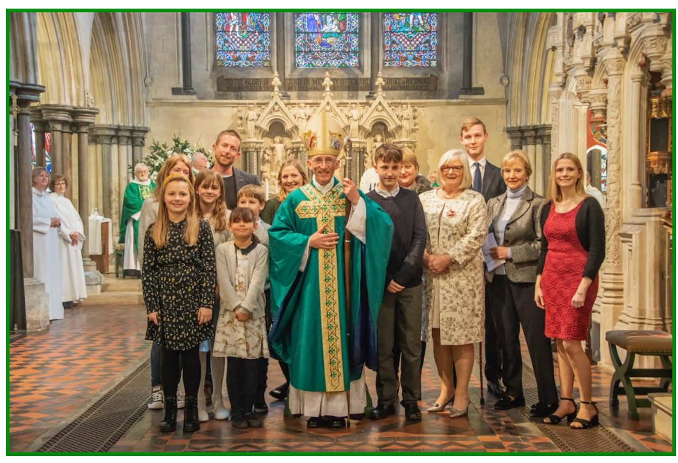
The Bishop of Chichester with the candidates for Baptism and Confirmation Sunday 16 February